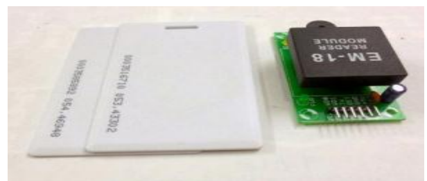
Fig 1. RFID card and Reader

However, their possible region of use is much bigger. This paper presents applications that are probable using RFID technology such as locate access control, location tracking, billing easily and others. RFID tags are expected to multiply into the billions over the coming few years and yet, they are been treated the same way as barcodes without taking into consideration the impact that this advanced technology has on privacy.